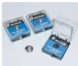
Premium fine finish and twist tip range available