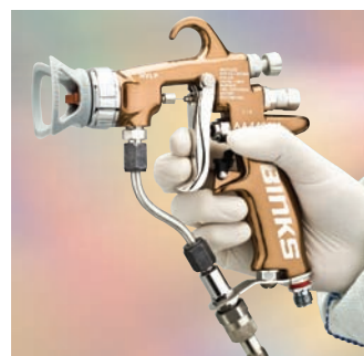
Pt. No. 0909-4400-10000E AA4400M AAA GUN with AA10 Air Cap