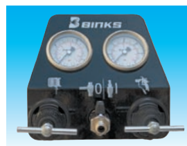
Easy to use controls