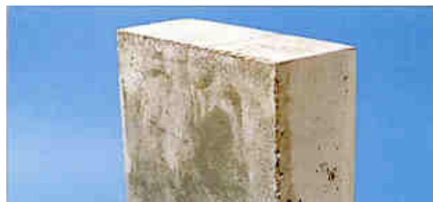
2 hours after application