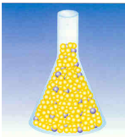
Emer-Stop Creme consists of 80% silane and 20% water