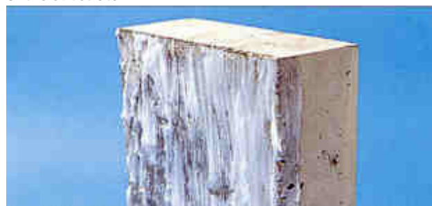
Emer-Stop Creme freshly applied

Note: these coverage figures are theoretical. Generally only one coat is required, depending on the absorbency of the substrate.