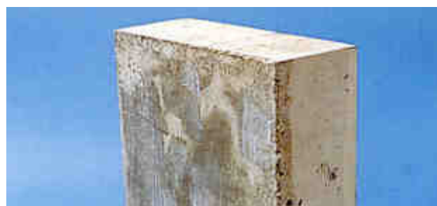
30 minutes after application