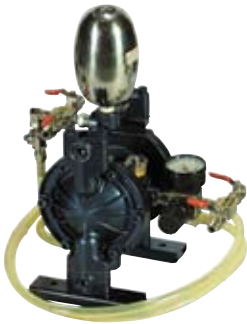
02300 DIAPHRAGM PUMP SPRAY UNIT

Specification: Pressure ratio 1:1, Transmitting capacity: 5L/min (0.4kg/cm) - 6psi, 7.5L/min (1kg/cm) - 14psi, 10.5L/min (2kg/cm) - 28psi, Air pressure: 1-5 kg/cm, Max painting pressure: 5kg/cm, Max pump speed: 160 times/min, Min pump speed: 80 times/min, Air required 4cfm, Double Teflon Diaphragm, Pick up hose with strainer, Air regulator, Spray Dampener, recirculating hose, dual paint outlet,