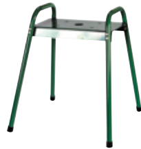
02310 PUMP STAND

Specification: Pressure ratio 1:1, Transmitting capacity: 5L/min (0.4kg/cm) - 6psi, 7.5L/min (1kg/cm) - 14psi, 10.5L/min (2kg/cm) - 28psi, Air pressure: 1-5 kg/cm, Max painting pressure: 5kg/cm, Max pump speed: 160 times/min, Min pump speed: 80 times/min, Air required 4cfm, Double Teflon Diaphragm, Pick up hose with strainer, Air regulator, Spray Dampener, recirculating hose, dual paint outlet,